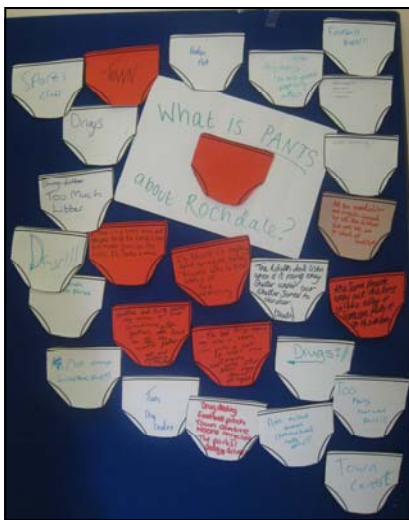
Views on what needs to change for children in Rochdale