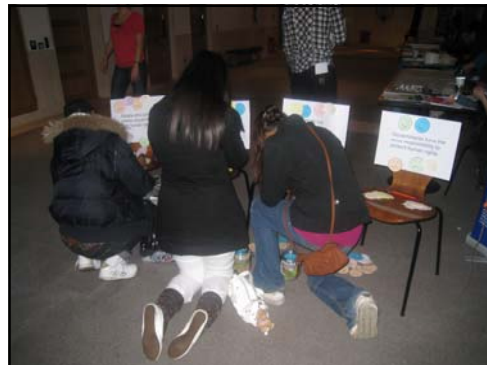
Children's rights activities at the British Library in London

Get ready for change! also celebrated the 60th anniversary of the UN Declaration on Human Rights at an event at the British Library in London called 'Ours by right: A day for the human family'. We had an interactive stall with games, art and human rights activities for children and their families.